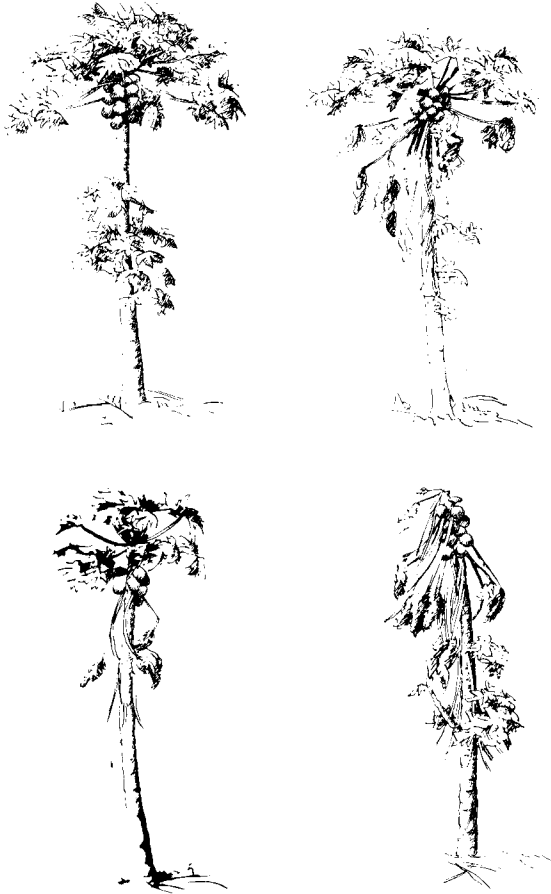
The development of St. Croix decline is gradual terminating in a marked pencilpoint effect and death.

Papaya decline can be caused by one or more fungi. It has often been confused with bunchy top, which is a virus disease. An early symptom is the free flow of latex when the plant is wounded; it is visible on the leaves. Swelling of the trunk occurs frequently, and the canopy is much reduced; and eventually the plant resembles a pencil, pointed at the top.