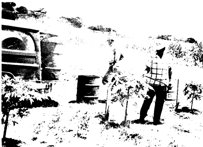
Continuous spraying is an essential for economic production of papaya.

These different diseases often have similar symptoms. The commercial papaya grower should learn to recognize these symptoms and use proper and timely control measures.