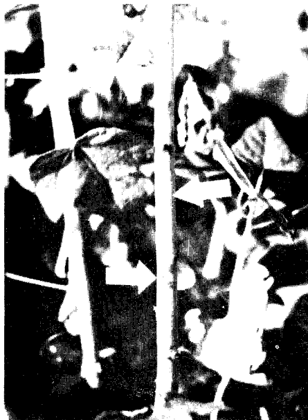
Water-soaked or greasy areas appear on the stems of papaya affected by St. Croix decline.