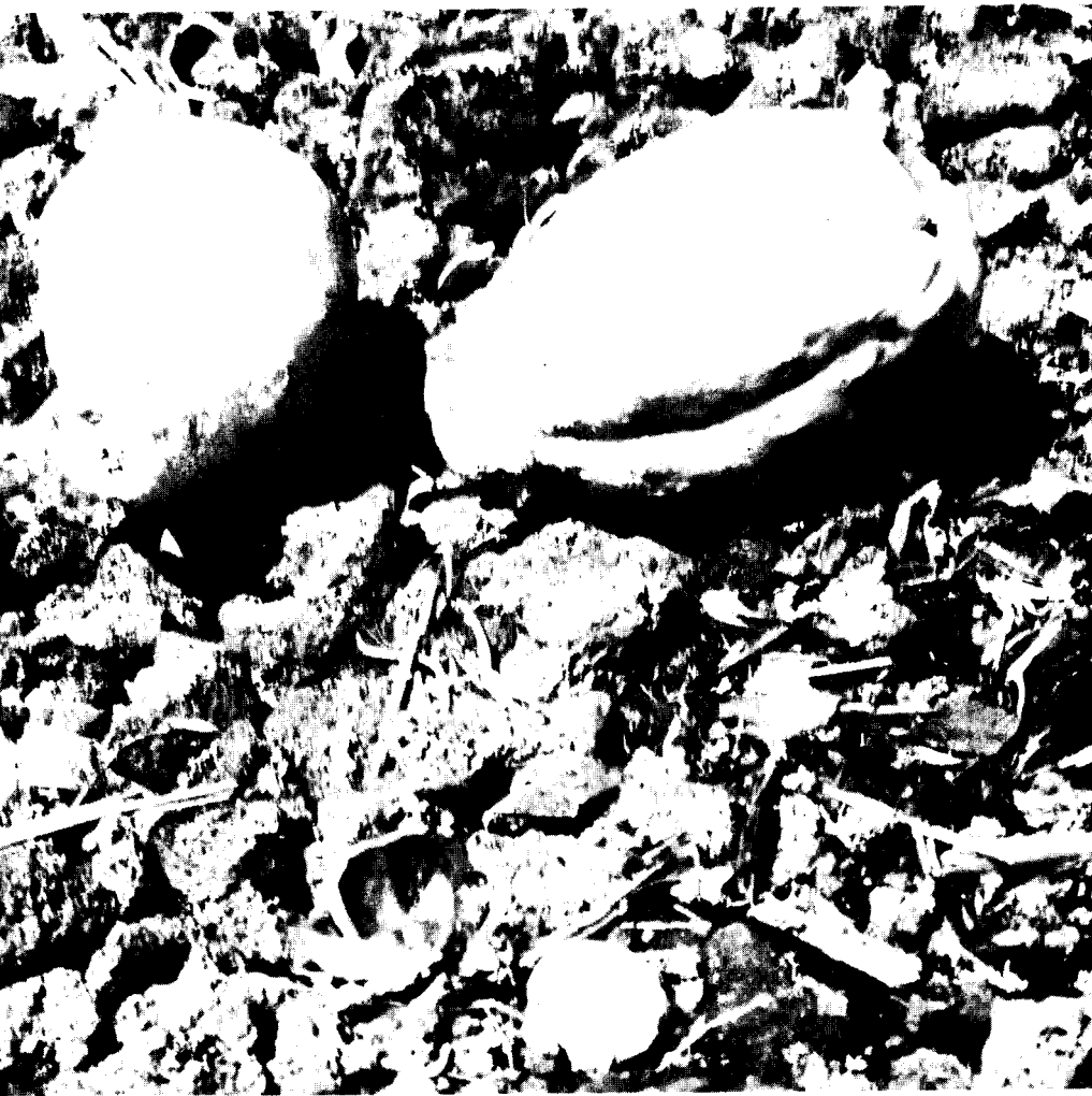
Fruit drops from a plant attacked by phytophthora becomes mummified and changes color to a light gray brown.