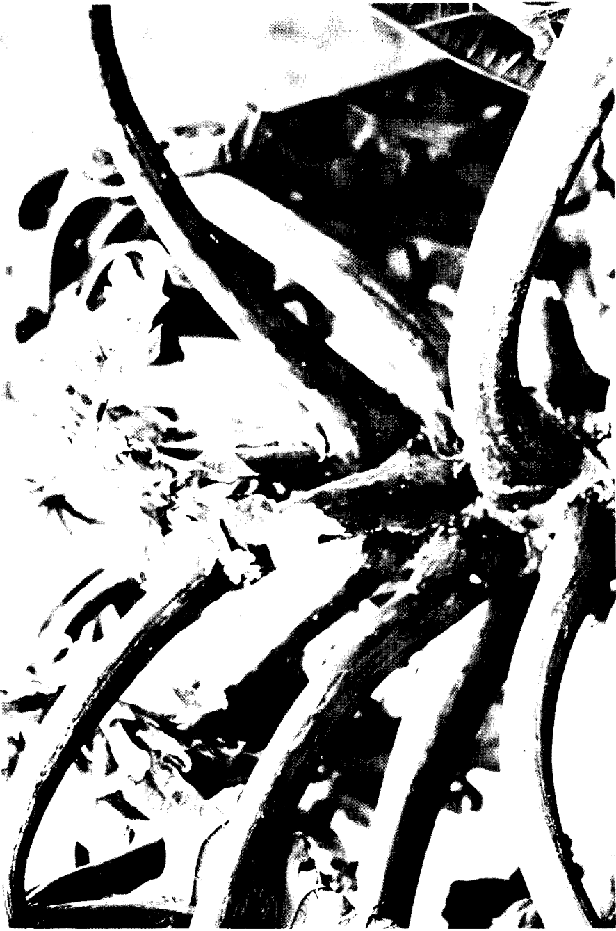
Bunchy top is symptomised by a marked reduction, or bunching of apical growth, and some chlorosis.