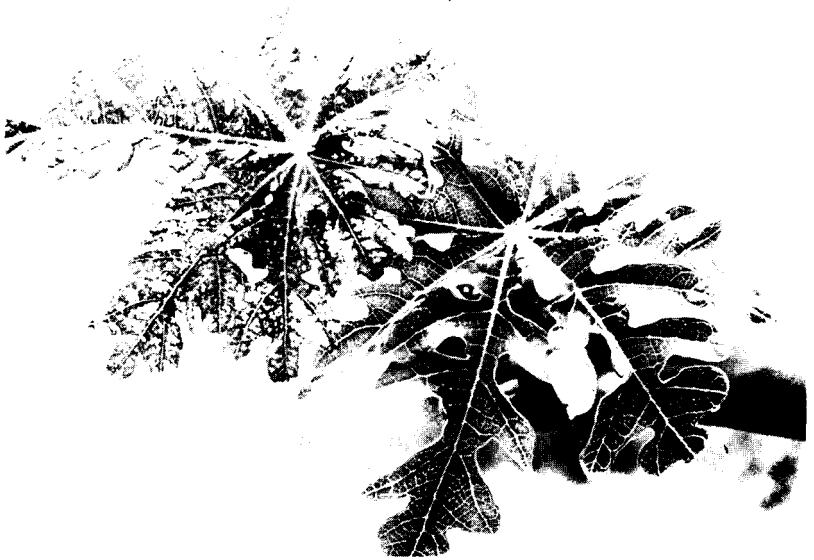
Symptoms of mosaic include mottling, crinkling and necrotic or chlorotic areas. Mosaic left, healthy right.

This virus disease causes marked chlorotic mottling, distortion of the leaf laminae, and stunted growth. This is reflected by the size of internodes, leaves, and petioles. Mosaics are not always fatal to plantings. In many cases, plants will live and continue to bear some fruit, although yields are lowered.