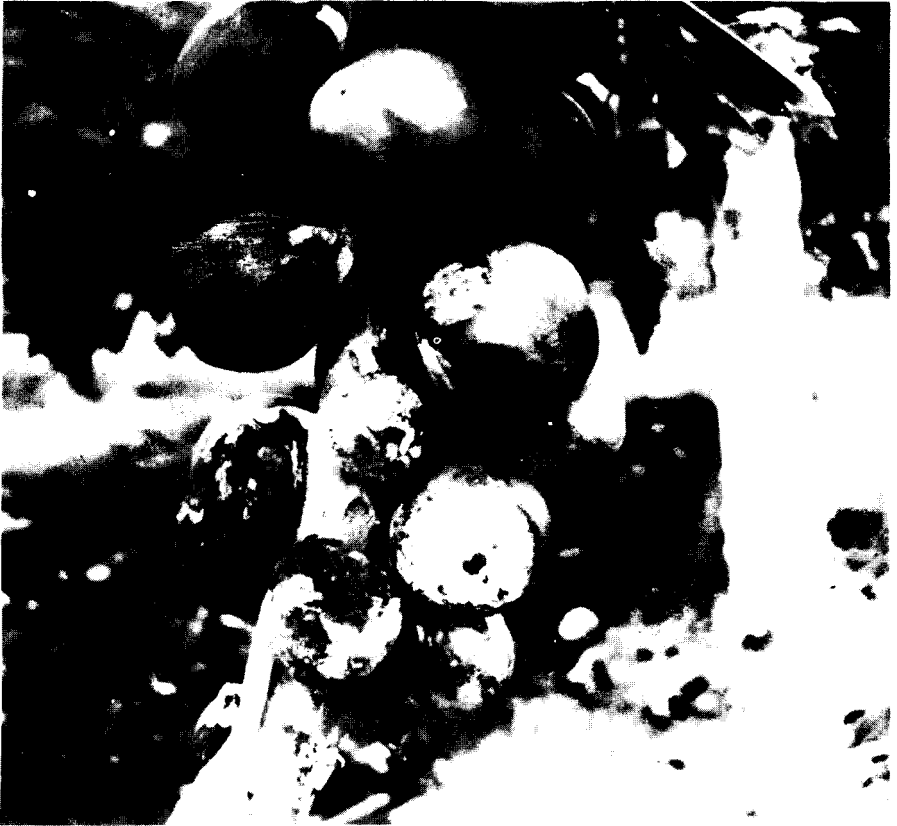
Phytophthora symptoms on the fruit of a diseased tree appear as lighter colored dried areas.

Phytophthora , which is usually found where soil water content is high, is a serious fungus disease. It attacks both the fruit and plant stems. Areas infected may enlarge and girdle the stems of young plants, causing wilting and consequent death. In older trees lesions may weaken the stem so much that the tops are blown down. Fruits become shriveled and take on a grayish color before they drop to the ground.