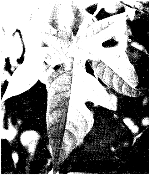
Necrotic lesions are a typical symptom of St. Croix decline ( Corynespora cassiicola ).