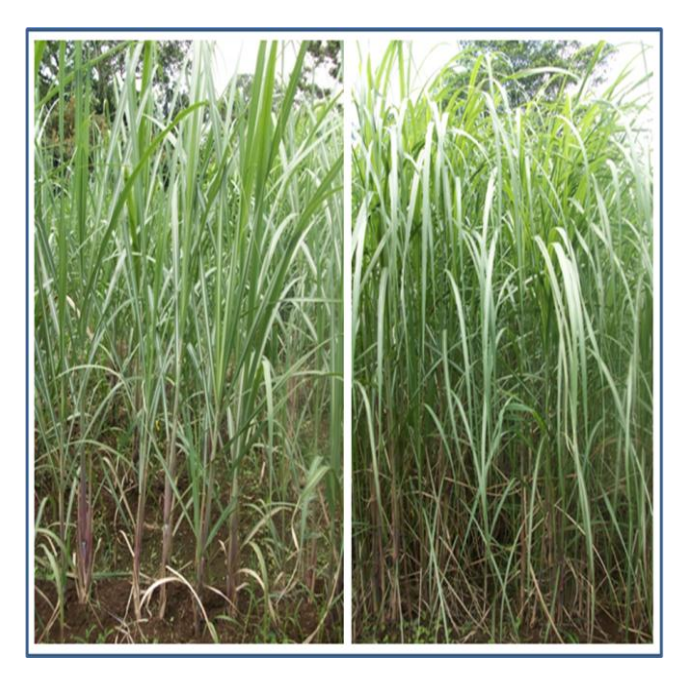
Figure 1. Phenotypical differences in stalk number, height, thickness and in leaf number and area between a commercial sugarcane var. Pindar (left) and an energycane clone US 88-1006 (right).

Mediterranean conditions (Mack 2008, Matineo et al. 2009), showed very poor growth and yield. During the growing season, differences in leaf area index (LAI) and stalk number per unit area reflected the differences that were later observed in fresh weight production. Therefore, these two indicators could be useful for germplasm selection programs.