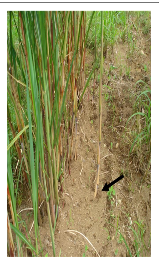
Figure 4. Lateral vegetative growth of energycane (indicated by the arrow) grown under tropical conditions in Limón, Costa Rica in 2010.